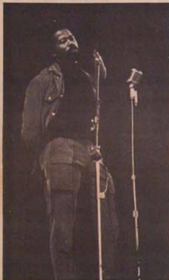
ELDRIDGE CLEAVER MINISTER OF INFORMATION, BPP

Do the American people have a remedy or do we just have to accept this even after it becomes obvious? What are we supposed to do? Do we accept this, do we sit around and watch our comrades being murdered even when it becomes obvious? Do we have no remedy must we accept this? We're not going to accept this, and we say that our comrades must be avenged, and those who are responsible for these vicious murders must be punished and we must have justice."