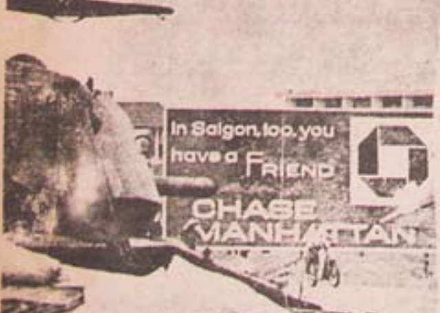
EXPLOITATION BY ROCKEFELLER-- U.S. IMPERIALIST

"The plight of the policeman and his wife -- who must work for the family's survival -- is similar to that of hundreds of Saigon families."